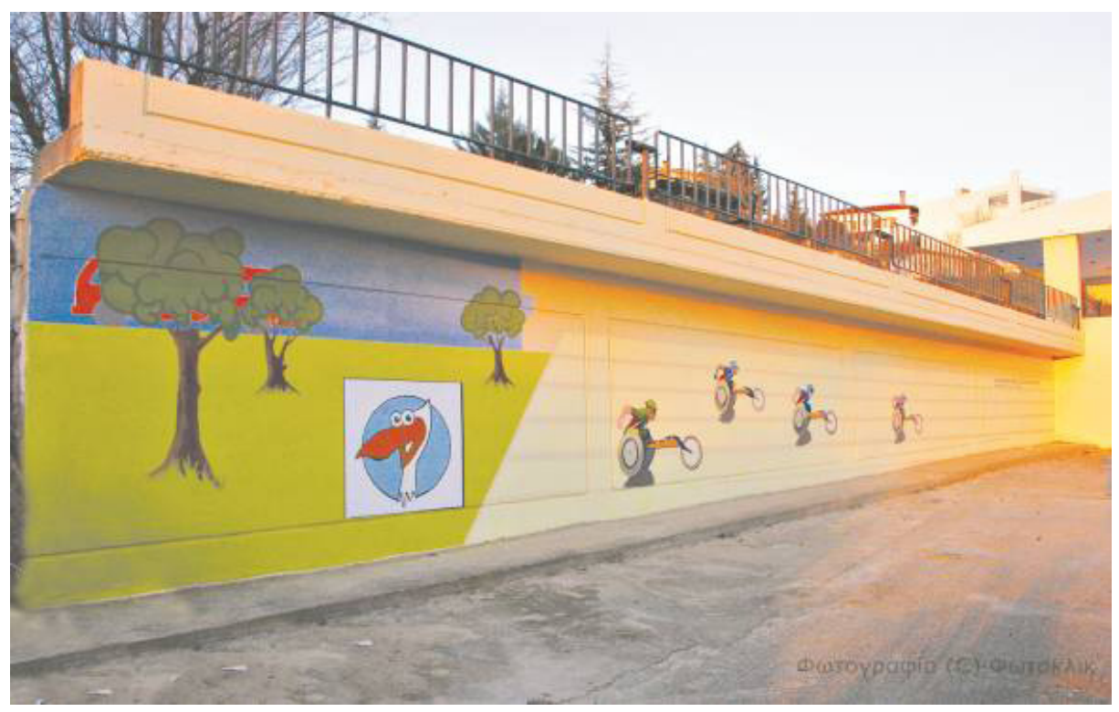
View of the final product of the activity